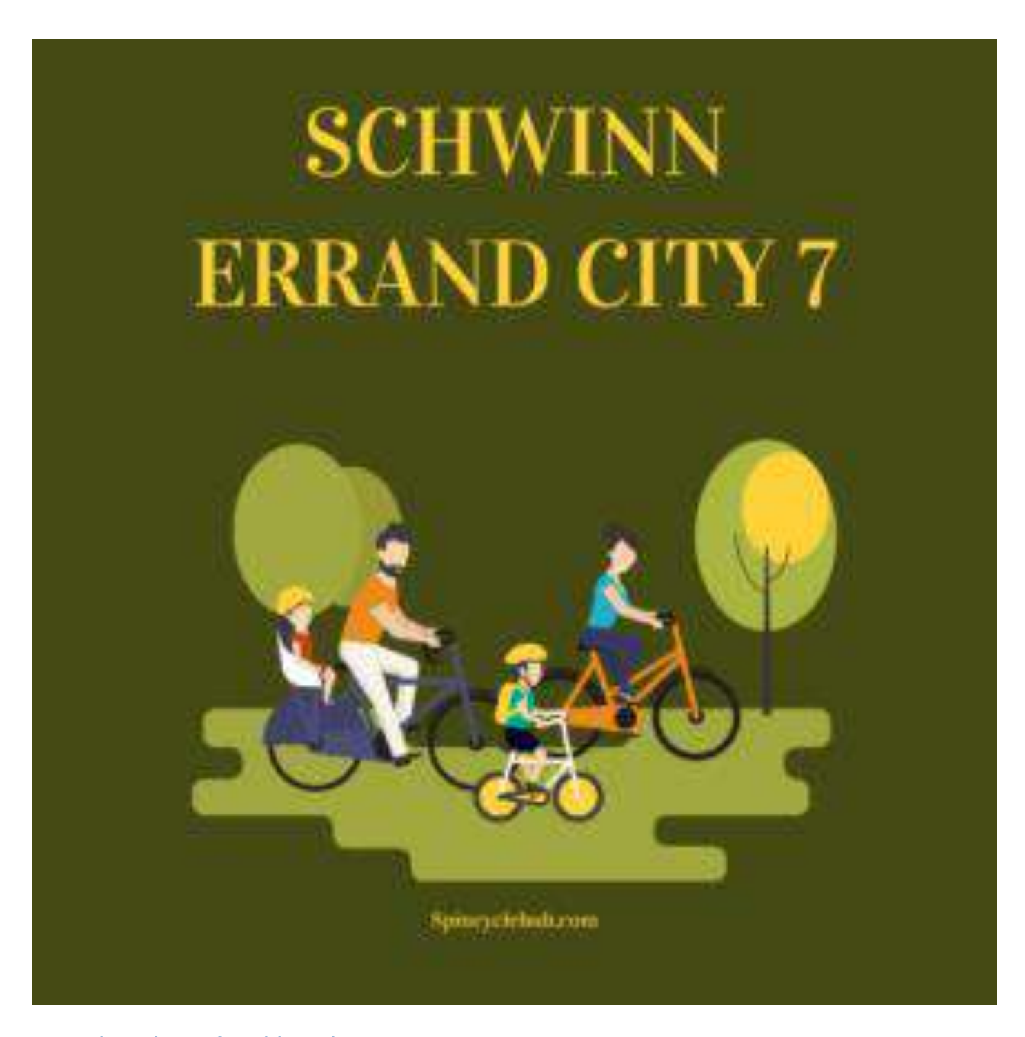
Smooth and Comfortable Riding Experience

City riding can be unpredictable, with uneven roads and unexpected bumps along the way. The Schwinn Errand City 7 is equipped with a sturdy yet lightweight aluminum frame that absorbs shocks and vibrations, providing