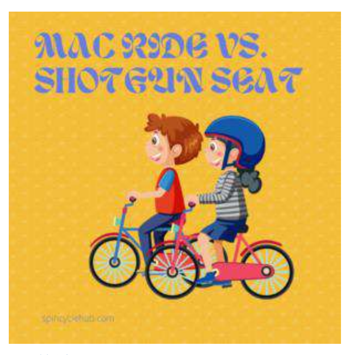
Mac Ride's Safety Features

The Mac Ride boasts a secure and sturdy design. It features a strong, adjustable steel bracket that attaches to your bike's steerer tube, ensuring stability during rides. The seat itself is made of durable rubber, providing